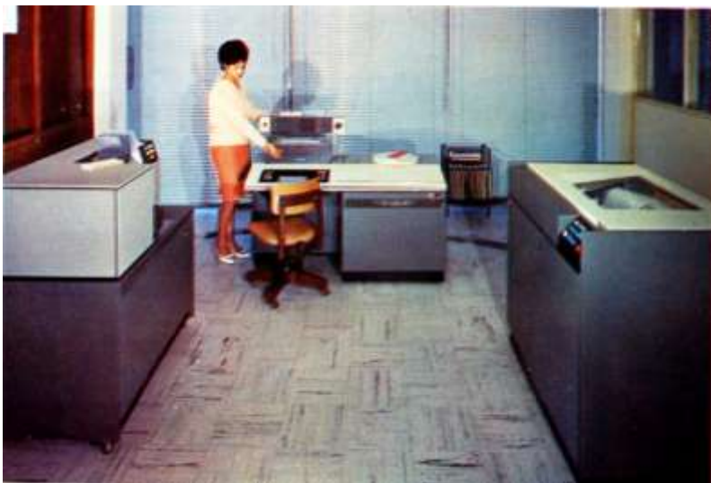
The first IBM 1130 at Aereofoto, circa 1966.

Even though the 1130 still required an air-conditioned room, a dust free environment, and input via punched cards, it remained small and cheap when compared with the large mainframes being deployed at banks and government offices at the time. It was also a relatively low expenditure when compared with investments in equipment and working capital made in other parts of a growing construction and heavy engineering company. 56 Moreover, the monthly rent was roughly equivalent to the monthly payroll of three senior engineers and therefore, its cost could easily be recouped by any of the usual studies and projects in which Aereofoto was involved at the time. 57