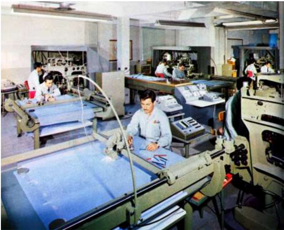
Mechanization of engineering projects at ICA. Photogrammetry capabilities for highway design included a punched card machine (towards the back). Aereofoto circa 1967.

In parallel with the accounting control system, the team built a payroll system for Aereofoto. It aimed to automate manual processes by updating staff turnover files and daily attendance to generate paychecks as well as debits and credits to the general ledger. The payroll was run weekly and paid in cash. This application was attractive not only because of the need to automate but because it would consume computer time at regular intervals. 68 Developing the payroll application proved to be quite a challenge for the programming team. 69 The main hurdle was that at the time the 1130 would only run FORTRAN, intended for scientific applications, rather than the administrative programming language COBOL. FORTRAN for the 1130 used floating point arithmetic and would often round up. Hence adding and multiplying subroutines were developed in order that individual checks and the ultimate accounting tally for pesos and cents was accurate. 70 Why was such a generic application developed from scratch? IBM did offer some sort of payroll application for the 1130. But IBM's software was based on US laws, requirement and