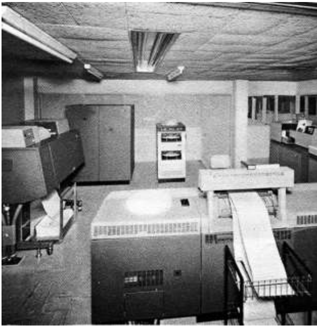
Second IBM 1130 at Aereofoto circa 1968. This time an effort was made to house it under more suitable conditions.