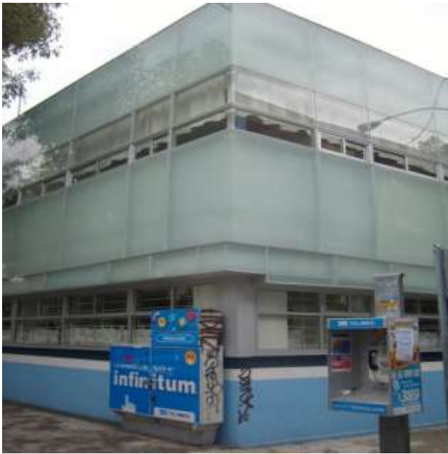
Building that housed Aereofoto in the 1960s (Obrero Mundial # 338, Col. Narvarte). The IBM1130 was located in the second floor. September 2009