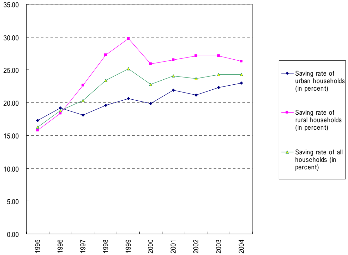
Figure 2: Household Saving Rate in China, 1995-2004

Source: Authors' calculations based on China Statistics Yearbook, 1996-2005 editions