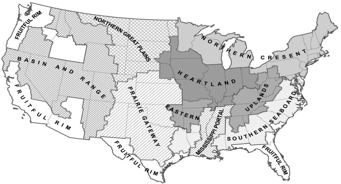
Figure 2. Economic Research Service Farm Resource Regions.