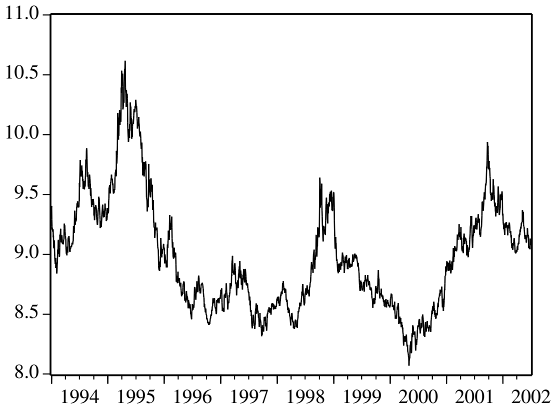
Fig. 1. The SEK/EUR exchange rate

Sample: 1.1994-6.2002. Note that for observations prior to January 1, 1999, we use DEM instead of EUR. Before January 1, 1999 the majority of SEK trading was conducted in DEM as it is currently conducted in EUR.