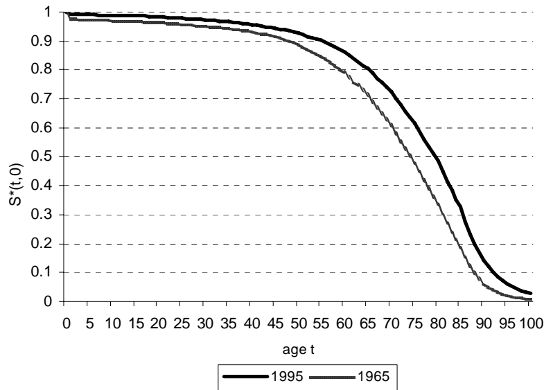
Figure 2: Survival Probabilities for the U.S. Population (from age 0 to t ), 1965 and 1995

Of the parameters and variables needed, some are common in the “value of life” literature. First, interest rates are assumed to be 3% per year, and this number is used to calculate the discounted survival functions ( S(t, a) ). The assumption of subjective rate of time preference equal to the interest rate implies constant consumption throughout life. Since we are not interested in life-cycle considerations, and this facilitates the empirical implementation of the model, it is the best way to proceed. This allows the consumption term in the willingness to pay expressions to be factored as (\varepsilon_c^{-1} - 1) c \int_i^\infty S_\theta(t, i) dt . Consumption is set to the 1965 value of total per capita consumption ($13,835, equal to private plus government consumption in 1996 US$), obtained from the Federal Reserve Board Economic Database (FED). 13 Following Becker, Philipson, and