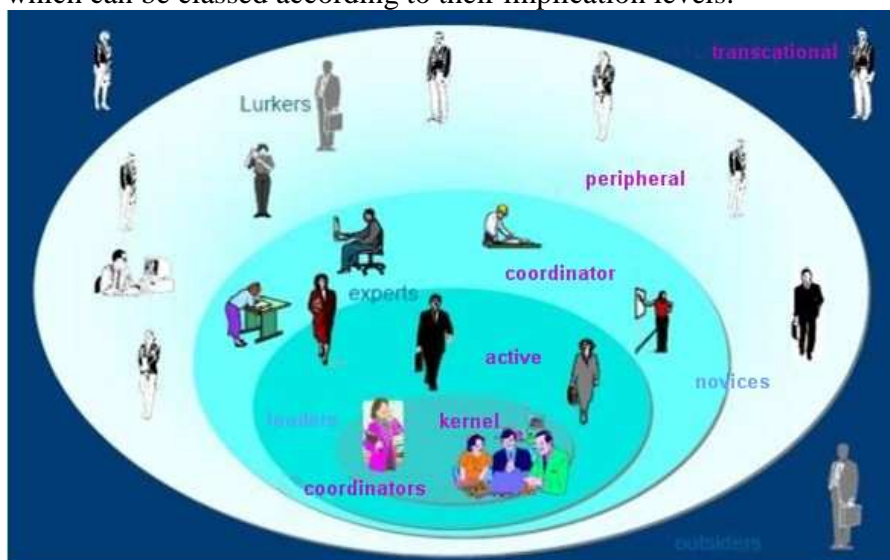
Figure 2: Levels of participation ([Soulier, 2004] adapted from [Wenger, 01])

There are different types of actors in a CoP (coordinator/facilitator, expert, sponsor, leader, administrators, passive members, lurker...) which can be classed according to their implication levels.