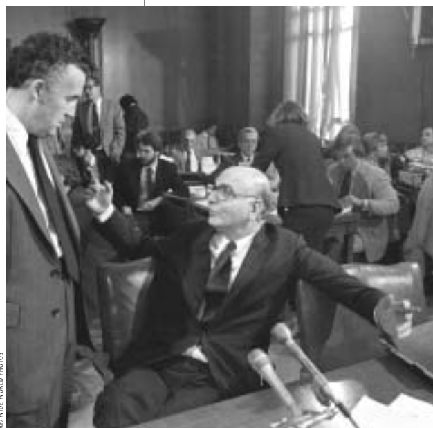
Former Federal Reserve Chairman Paul Volcker talks with Sen. Paul Sarbanes of Maryland prior to a 1979 Senate hearing on monetary policy. The Federal Reserve is formally independent of the executive and legislative branches, but the President appoints the Fed's chairman, who must report regularly to Congress.

Inflation can also act as a source of revenue for governments, further tempting them. Even if a government promises not to inflate, the public may remain skeptical, producing high inflationary expectations. By delegating responsibility for money creation to a central bank, the legislature can remove the temptation to abuse its power and pursue bad monetary policy for short-run gain. (It is important to note that this temptation to