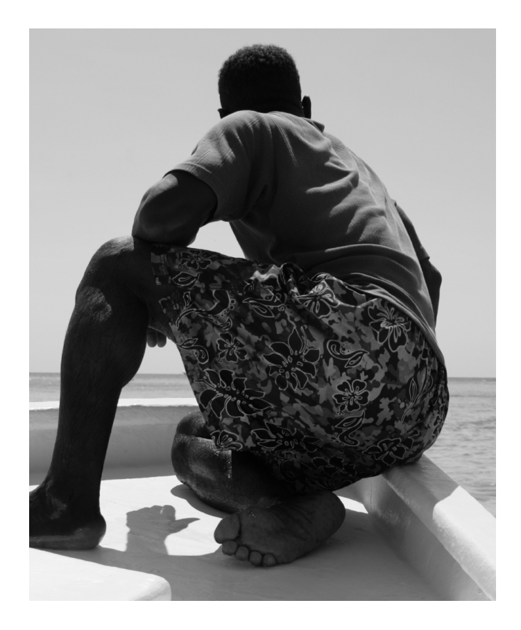
A CARIBBEAN MAN LOOKS OUT ON THE 'BLACK ATLANTIC'. AS IDEAS, PEOPLE AND POPULAR CULTURE CRISSCROSSED BETWEEN AFRICA, THE AMERICAS AND EUROPE, A DETERRITORIALIZED DIASPORA AND A FLUID IDEA OF HOME HAVE EMERGED

Despite this, Caribbean peoples can be considered an exemplary case of a deterritorialized diaspora. This arises first from their common history of forcible dispersion through the slave trade – still shared by virtually all people of African descent, despite their subsequent liberation, settlement and citizenship in the various countries of the New World and beyond. Partly, this is a matter of visibility. Unlike (say) in the cases of Jews or Armenians, where superficial disappearance is possible in Europe and North America if exogamy occurs, in the case of those of African descent skin colour normally remains a marker for, two, three or more generations – despite exogamy. The deployment of skin colour in many societies as a signifier of status, power and opportunity, make it impossible for any people of African descent to avoid racial stigmatization. As one black British writer graphically puts it, 'our imaginations are conditioned by an enduring proximity to regimes of racial terror'. <sup>36</sup>