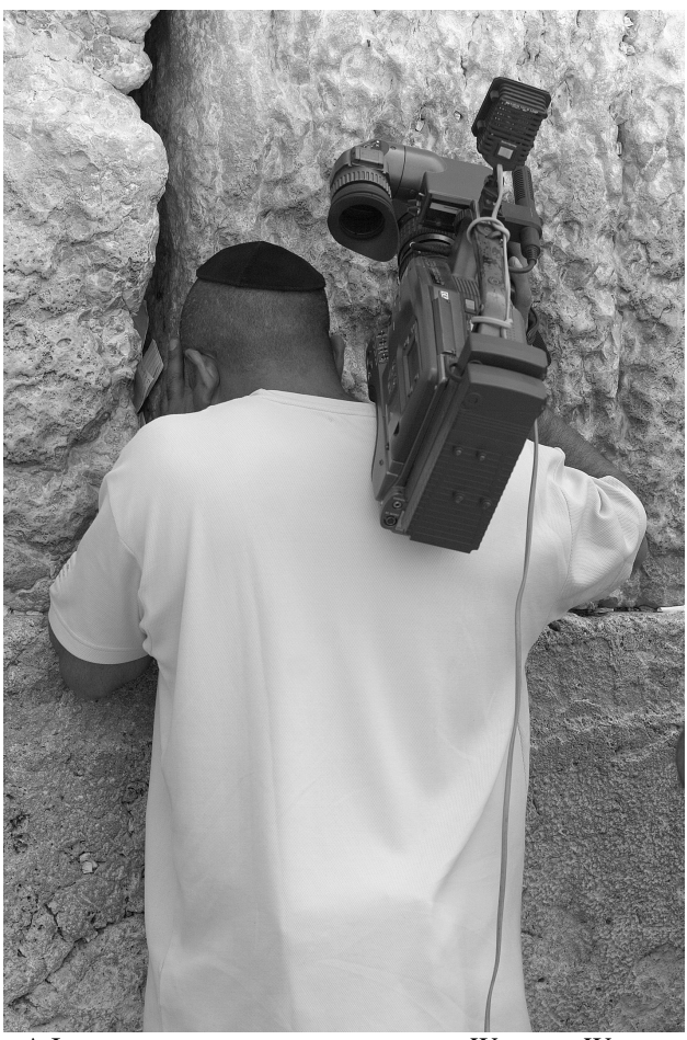
A JEWISH CAMERAMAN PRAYS AT THE WAILING WALL, A SOLID REMNANT OF THE OLD HOMELAND

In other interpretations, the nurturing white milk of the motherland is replaced by the blood of soldiers gallantly defending their fatherland. Their blood nourishes the soil, the soil defines their ethnogenesis. Blut und Boden (blood and soil) was Bismarck's stirring call to the German nation, an evocation that was renewed by Hitler two generations later. Even in the wake of the post-1945 liberal-democratic constitutional settlement, the Germans were unusual in stressing a definition of citizenship and belonging -jus \ sanguinis , the law of blood - that emphasizes descent, rather than place of birth or long residence. Thus, third and fourth generation 'ethnic Germans' from the former Soviet Union, many of whom no longer spoke German,