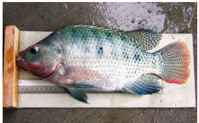
Genetically Improved Farmed Tilapia (GIFT)

Genetic improvement typically takes place in a relatively small population, in the order of a few hundred individuals selected per generation. The economic impact of genetic improvement in any such population is small, but it becomes spectacular when it is multiplied through hatcheries, disseminated to