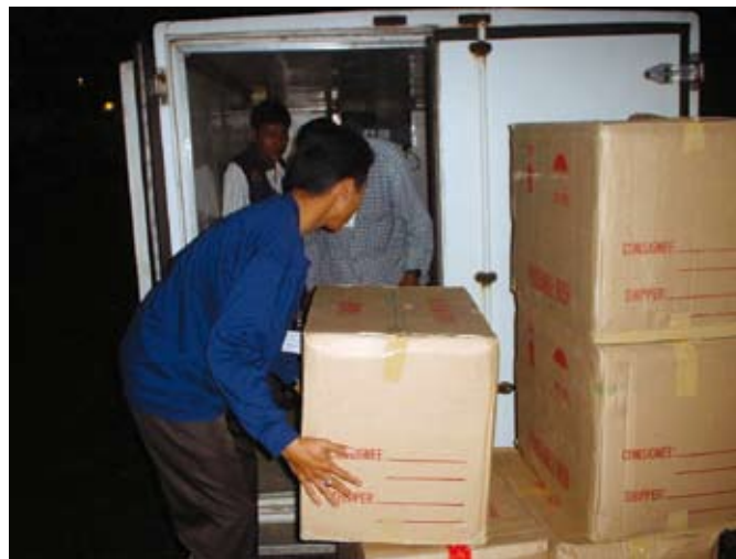
Dissemination of improved strain

The risks involved in the use of improved strains vary widely. Where aquaculture is already being practiced and one or more species are already being farmed, the use of a strain that has superior attributes from a production viewpoint relative to farmers' strains is unlikely to pose additional risks, especially if there are no particularly valuable wild populations of the same species nearby. This would be the case of an improved tilapia strain in many Asian countries. By contrast, where aquaculture is relatively new and there are still wild populations readily accessible by escapees of a genetically improved strain of the same species, the risks are high. The escapees may interbreed with the wild population with unknown but likely undesirable consequences (e.g., loss of the uniqueness of the wild population, change in the fitness of