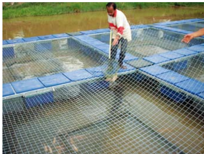
Local farmer at work

The desirable fish developed by the genetic improvement program have to reach the farmer (Step 7). This is the area that has generally proved to be the most problematic. The mechanisms whereby this can be achieved are simple in principle, but often difficult to implement in practice because they involve influencing people's attitudes and actions. The