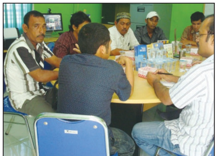
Members of an Aquaculture Livelihood Service Centre in Aceh engaged in discussion about their business plan

With respect to the private sector, it was found that medium-sized companies and multinationals from the North partnered with farmer cooperatives 49% of the time, with smallholders 38% (mostly involved within a wider group of private partners), aquaculture and fisheries associations 26%, and with community groups 19%. (The total exceeds 100% because there is often a mixture of private partners involved). This indicates that although there was strong representation from smallholders in the development partnerships, overall there was a preference for social groups such as cooperatives, associations and communities (94%). This reflects the desire for partnerships of economic scale. There is an understandable need to minimize the risk of failure of development projects. The public authorities want to achieve sustainability and multiplication of the benefits beyond the project’s duration and the private profit-oriented enterprises from developed countries will only invest when adequate returns on investment may be expected; hence they tend to work with larger producers or aggregated producers (cooperatives and associations). A requirement for the integrated partner to be of a certain economic scale was