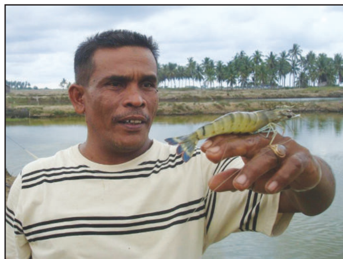
Proud shrimp farmer showing results from the successful rehabilitation of aquaculture in Aceh, Indonesia

A close examination of the PPPs revealed that many promoted the primary interests of private sector enterprises from developed countries. Their motivation is to enhance the value chain through improvements to the quality of both the product and the production chain, often twin prerequisites for access to international markets. A ranking of their objectives revealed the following results. Interventions in supply chains, including certification and marketing improvements, ranked highest at 23%, followed closely by corporate social responsibility activities and capacity building at 21% each. Other objectives, e.g., technology improvements, environmental management and conservation issues scored 12%, with research close behind at 11% 6 (Figure 1).