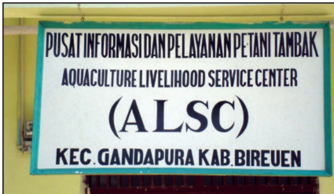
Four Aquaculture Livelihood Centers (ALSCs) now form the backbone of business organization for more than 2,600 shrimp farmers in Aceh, Indonesia

different sectors whereby they agree to work together to reach a common goal or fulfil a specific need that involves shared risks, responsibilities, means and competencies 4 . The underlying rationale for PPPs in the field of development is that certain types of social, economic and technological innovations can only be achieved when public sector organizations, private firms and civil society cooperate closely. We find a common understanding that development-oriented PPPs are constructs between public sector authorities from developed countries, often represented and managed by development agencies; strong financial and economic private sector partners from developed countries, and civil sector partners as implementing organizations. Such PPPs target development of (private) producers or communities in developing countries.