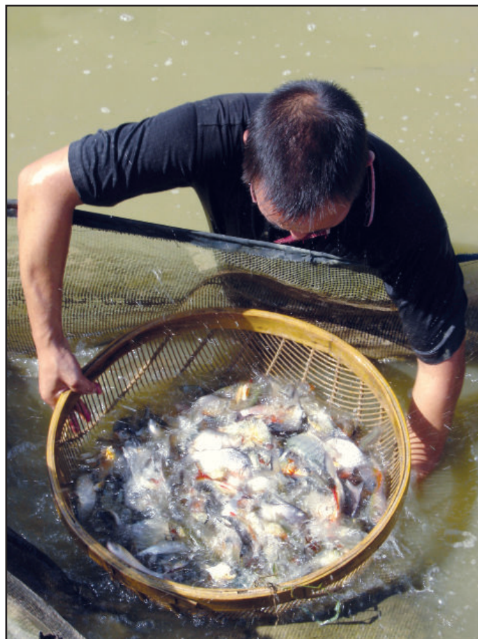
Aquaculture farmer in China controlling the growth rate

The 'inclusive business' as well as the 'enterprise centered approach' for small-scale farmers and fishers, aims to raise single entrepreneurs to a sustainable commercial level through collective action. 'Horizontally working' interventions build 'farmer clusters', or groups, that coordinate the production planning and organizing the former 'single' farmers into 'one production unit' at a feasible economic scale. 'Vertically working' interventions are essential for financing and ensuring the sustainability of the system. These include factors such as managing the supply of finances, knowledge transfer, and technical inputs (mainly seed, feed and fertilizer), plus organizing the business relationships for sales. This involves processing, logistics and transport to local, national and export markets, certification and traceability of the products. Competitiveness with other producers in today's markets, enabled by the new financial, managerial and technical business elements, could produce a sustainable surplus for growth for low income producers and other low income operators in seafood value chains.