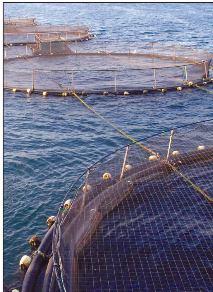
Fish net cages in Malawi; aquaculture production for local food security