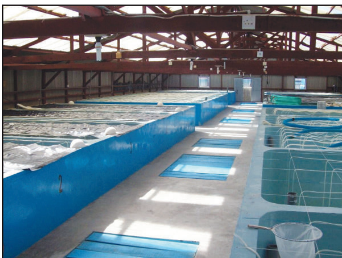
Shrimp hatchery in Aceh, supported by the USAID funded PPP project AMARTA