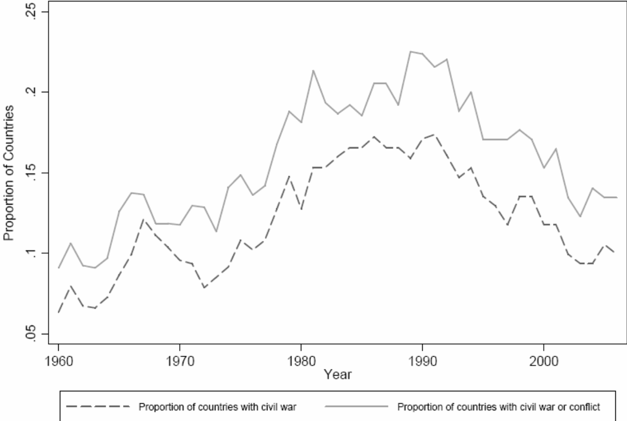
Figure 2: Proportion of countries with an active civil war or civil conflict, 1960-2006