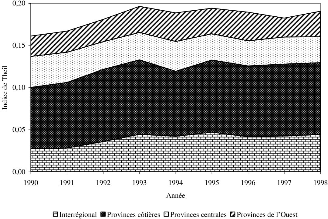
Figure 1 - Decomposition of the Theil Index : Real GDP per capita