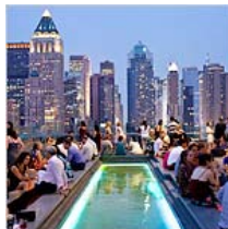
Manhattan's Rooftop Bars: Heaven's Gates