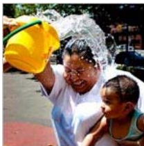
No Matter How You Cut It, a July That's Too Hot