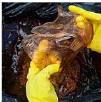
Death Does Not Deter Jellyfish Sting