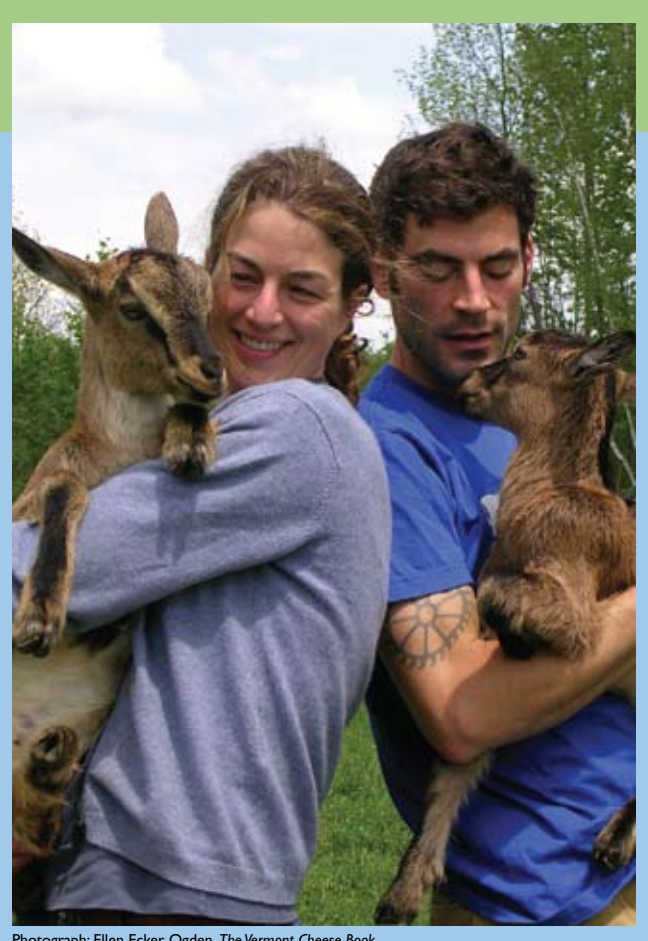
Photograph: Ellen Ecker Ogden, The Vermont Cheese Book