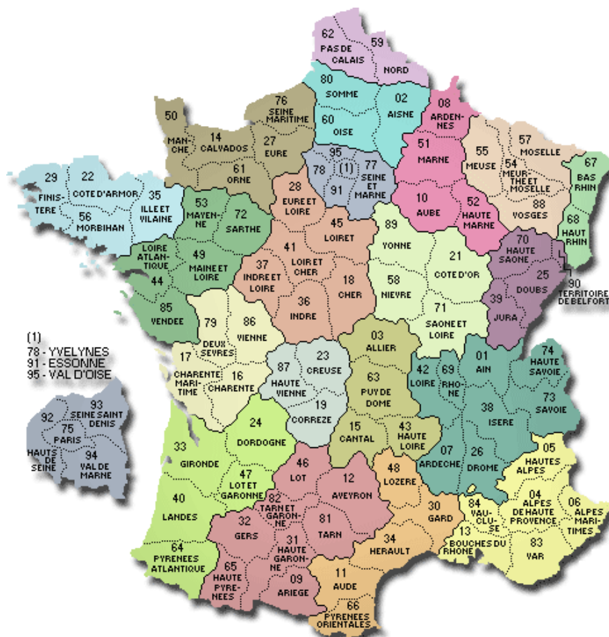
Figure A.1: French “départements”