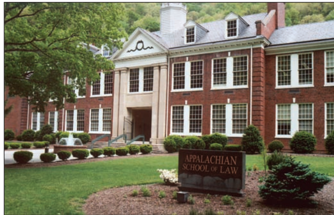
The Appalachian School of Law in Grundy, Va., trains lawyers primarily for solo and midsize practices in the Appalachian region. The school in June was fully accredited by the American Bar Association.

have increased. Education can raise standards of living and draw jobs.