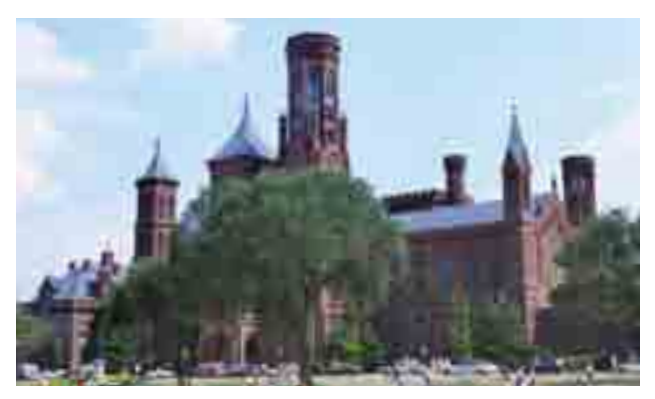
Tourism to landmarks like the Smithsonian Institution has been affected by tighter visa regulations.

Critics of the new standards acknowledge the importance of secure bor-