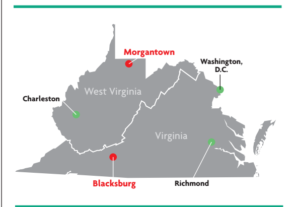
The cities of Blacksburg, Va., and Morgantown, W.Va., are economically vibrant, thanks in large part to the presence of Virginia Tech and West Virginia University, respectively. But in these otherwise rural, somewhat isolated communities, the economic benefits of playing home to a university are limited. Neighboring towns, even those well within commuting distance, pale in economic performance by comparison.