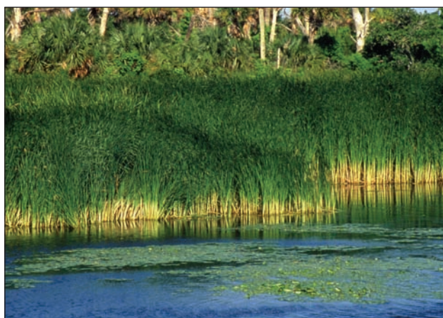
Linking pre-existing conserved areas, like South Carolina's Waccamaw National Wildlife Refuge (pictured here), with the land acquired from International Paper will better benefit waterfowl and protect water quality.