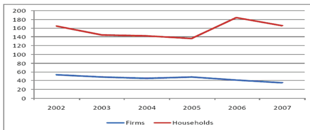
Figure 1: Cross-country dispersion in lending rates in the period 2003-2007

Figure 1 shows the cross-sectional standard deviation in interest rates to small business and households over 2002-2007, with the spreads showing relatively little convergence.