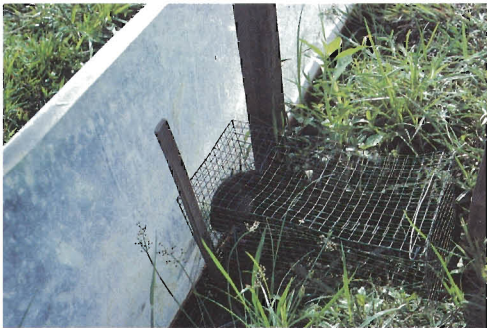
Plate 7. A physical barrier with a trap in position. This method was developed in Malaysia.