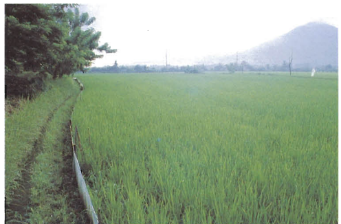
Plate 8. A linear barrier with traps on trial in the Philippines. The barrier is located between a likely rat harbourage and the developing rice crop.