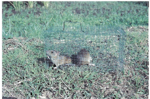
Plate 3. Wire live-capture traps with conical entrances are used in Malaysia, Philippines and Indonesia.