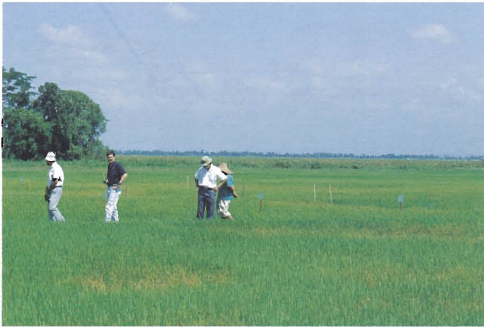
Plate 2. Rats typically cause foci of damage which often occur away from the edge of the crop (stadium effect). The yellow areas in this crop in Malaysia indicate damage caused by rats.