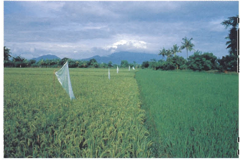
Plate 1. Sowing rice crops asynchronously prolongs the breeding season of rats — since rats breed from when the rice is milky ripe to when it is harvested.