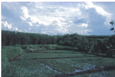
Plate 10. A diverse landscape in tropical Southeast Asia provides a haven for more than one species of rat.