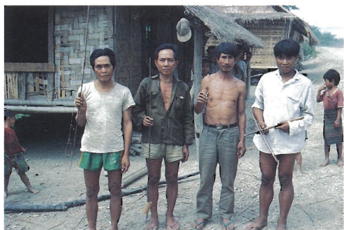
Plate 11. Various bamboo devices which garrotte or shoot (using a crossbow) rats have been developed by Laotians living in the uplands near Luang Prabang.