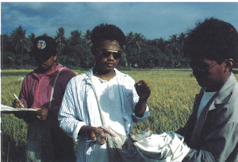
Plate 4. Processing of rats for information on their demography and breeding condition, Luzon, Philippines.