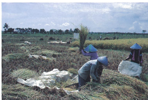
Plate 12. Most of the rice in Southeast Asia is hand threshed. This protracts the harvest and extends the availability of high quality food for the rats.