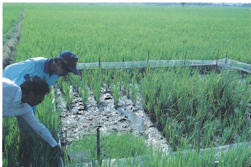
Plate 9. Milky ripe and freshly transplanted rice are used as a 'trap crop' at Pinrang, South Sulawesi. Multiple capture traps can be seen in each corner of the fence.