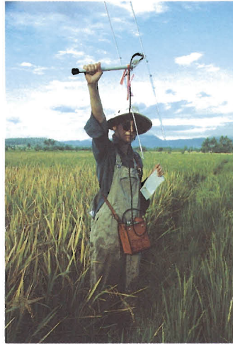
Plate 6. Aerials are attached to portable receivers to locate rats fitted with a radio. Apart from one daily check on nest sites, the tracking of rats is done at night when fixes are done each hour.