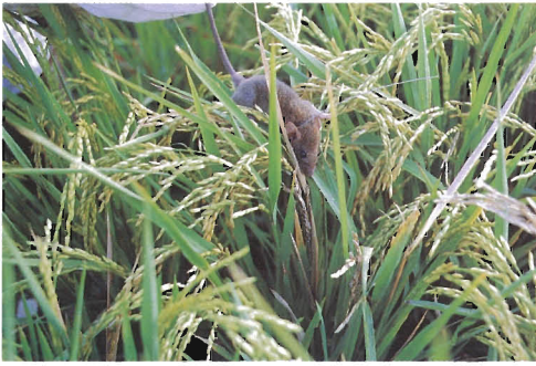
Plate 5. Rats are fitted with radio-collars to enable their movements to be tracked.