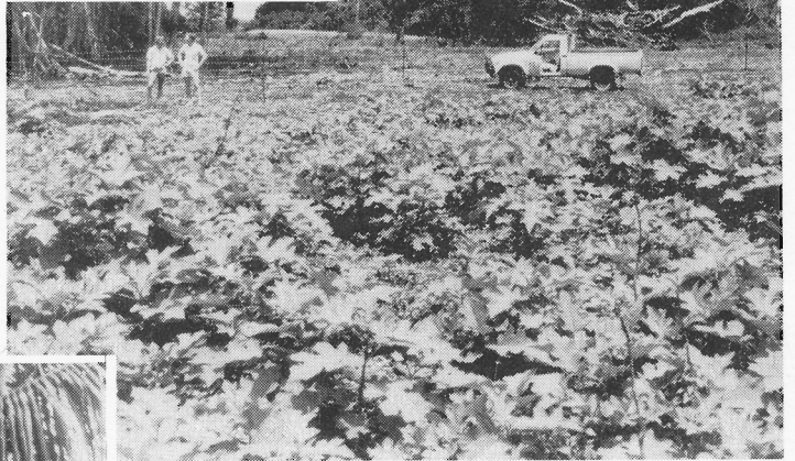
Solanum torvum establishes readily on many bulldozer-disturbed soils and grows rapidly in the absence of vigorous pasture competition.