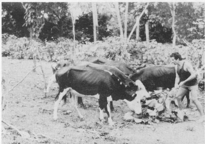
Overgrazing of carpet grass pastures (2-4 cm high) by smallholder cattle (about 3 AU/ha). Cattle being supplemented with Hibiscus from living fence.