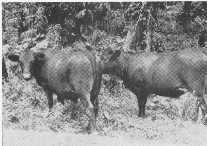
Smallholder heifers, 13.5 months old, and weighing 280-300 kg on Ambrym.