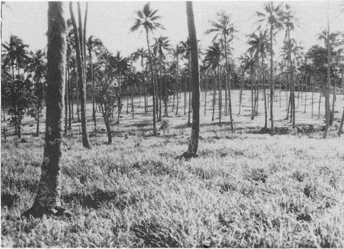
Embu grass under sparse old coconuts with buffalo grass in the background — Montmartre, Efaté.