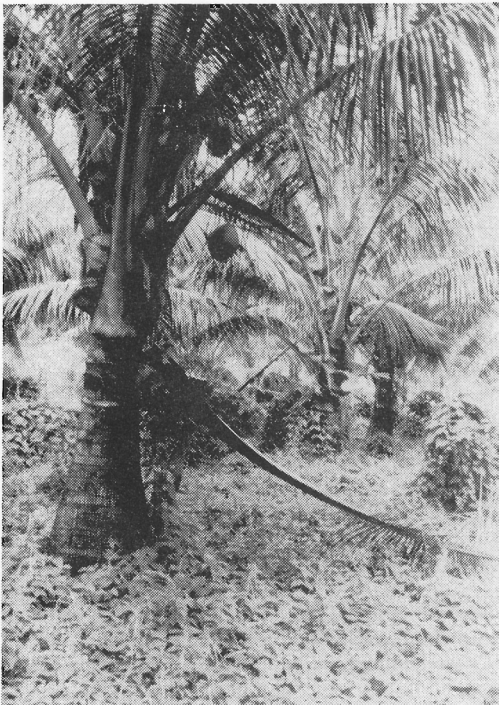
Mikania micrantha (mile-a-minute) is a major weed problem under young coconuts.