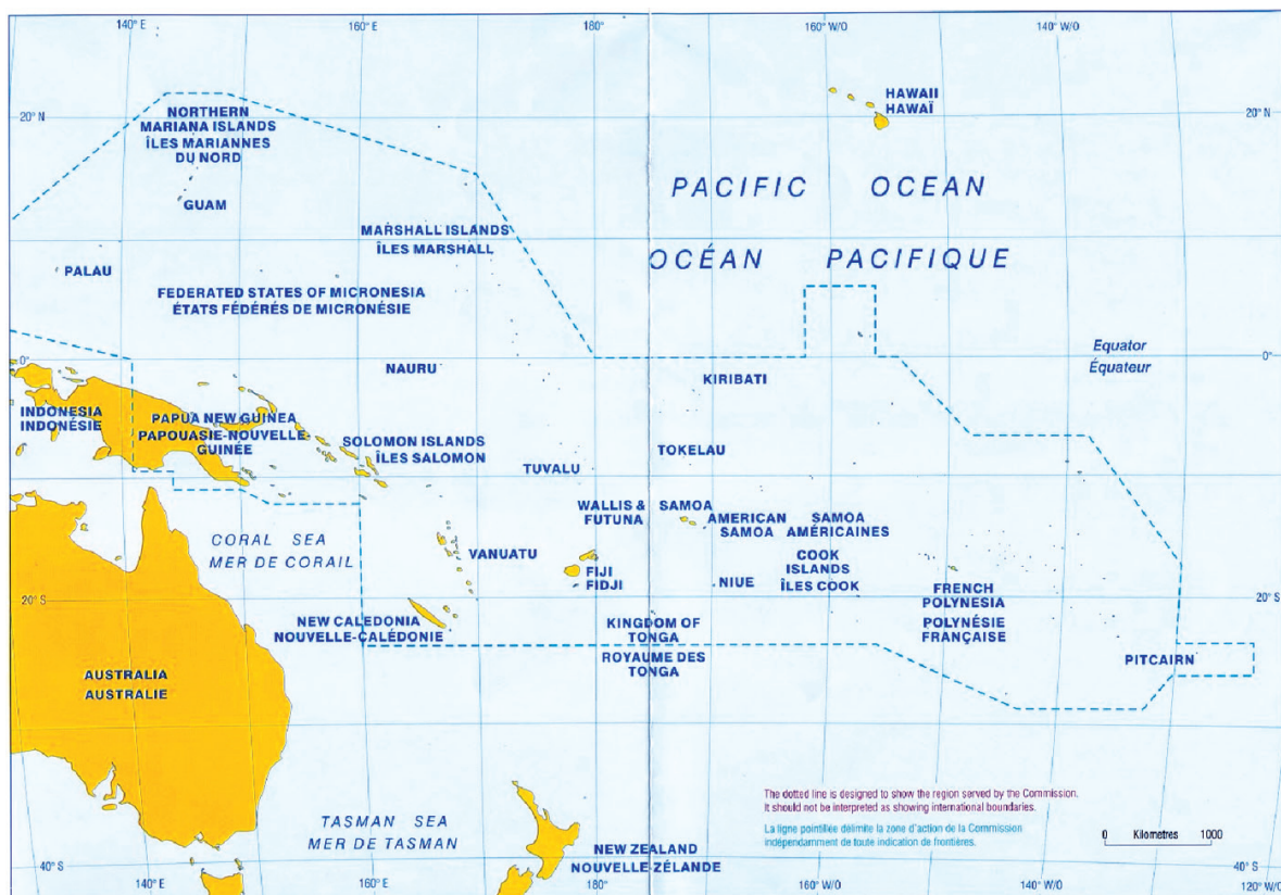
Figure 1. Map showing Pacific island countries.

Of the countries in which the fruit fly projects were implemented, Papua New Guinea has the highest crop production. Its land area is significantly greater than that of any of the other countries involved.