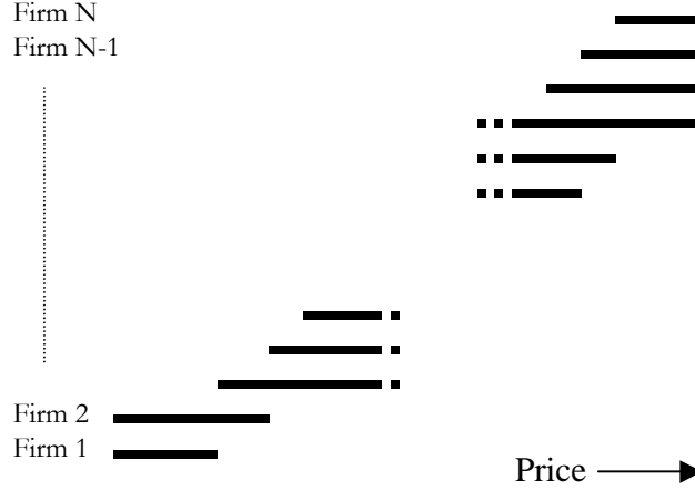
Figure 2: Price Supports

Now consider the “head-to-head” competition that occurs at some given price p . If p is offered in equilibrium, it is offered by a consecutive set of firms l, \dots, m . Each of these firms must be just indifferent to changing its offer slightly away from p . So for each n = l, \dots, m ,