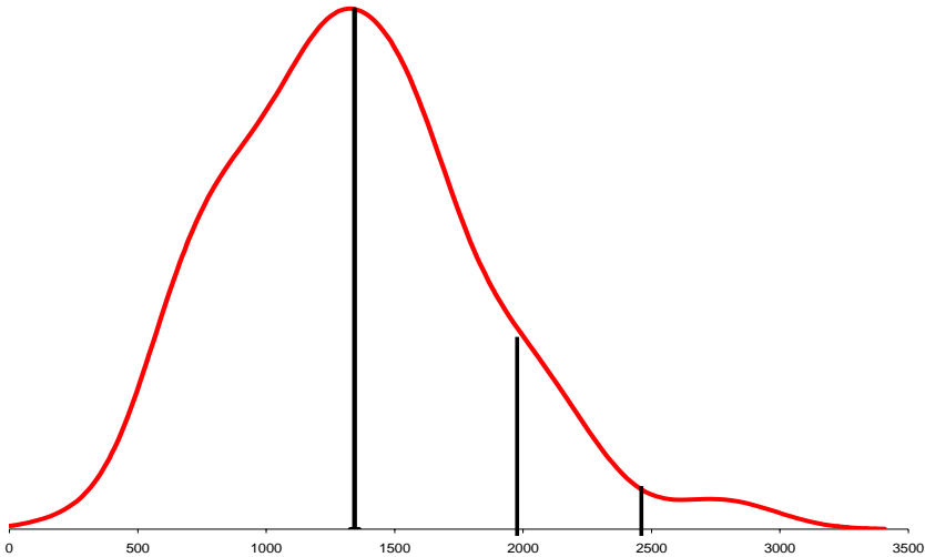
Figure 1: Distribution of August Rainfall for Andhra Pradesh