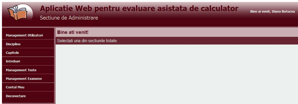
Fig. 1. The administration module

Inside the Exams Management section, the administrator authorizes the students to take the exam, after they have previously registered through an online form. The authorization algorithm we propose counts the students that have registered, validates the list of students and, with the professor's permission, triggers the exam. If a student is not authorized by the professor, he would immediately be removed from the waiting list. A log file is automatically generated, allowing the teacher to have full control over his admission lists and his taken exams. Figure 1 presents the main interface of the administration module.