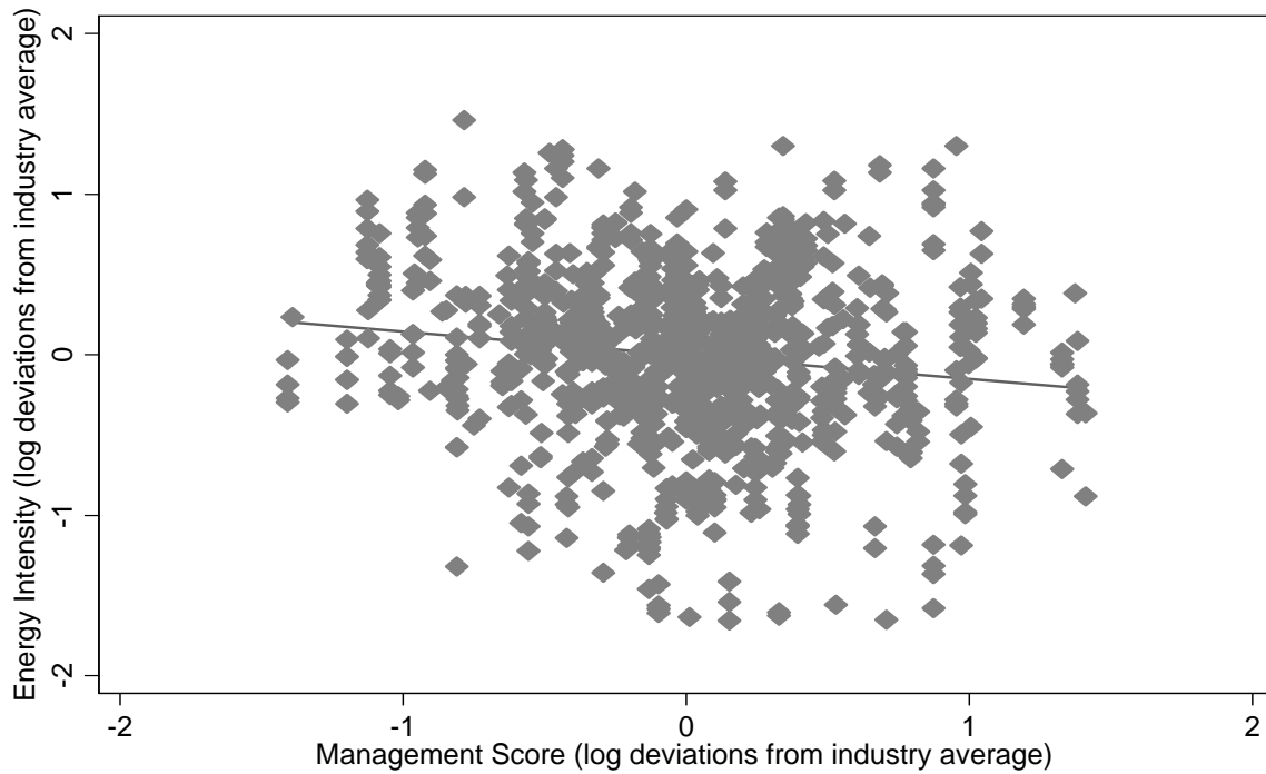
Figure 2: Energy intensity and management at the firm level (UK firms only)

Notes: Data from census of production (ARD) and CEP management survey. The graph shows a scatter plot of the residuals of a regression of energy intensity on industry sector binary indicators on the residuals of a regression of the management score on the same industry binary indicators.