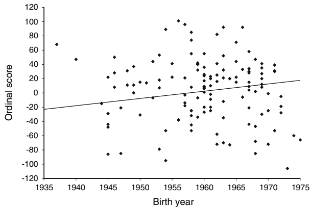
Figure 2 – Birth-year and ordinal ranking 2000–2004

are more likely to get cited. The cardinal ranking that only considers publications is not subject to this age-bias. As shown in Figure 1 there is even a mildly positive relationship between birth year and cardinal score. Figure 2 shows that the ordinal ranking is not subject to an age-bias either. Apparently, due to the 5 year time window young economists can achieve a higher ranking early in their career.