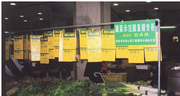
Photo 8. Demonstration stall selling “clean vegetables” in Jiayou supermarket in Hangzhou