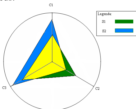
Fig.1. Functionality nomogram [5]

The system functionality describes a set of functions and their specified properties. The functions are those that satisfy stated or implied needs.