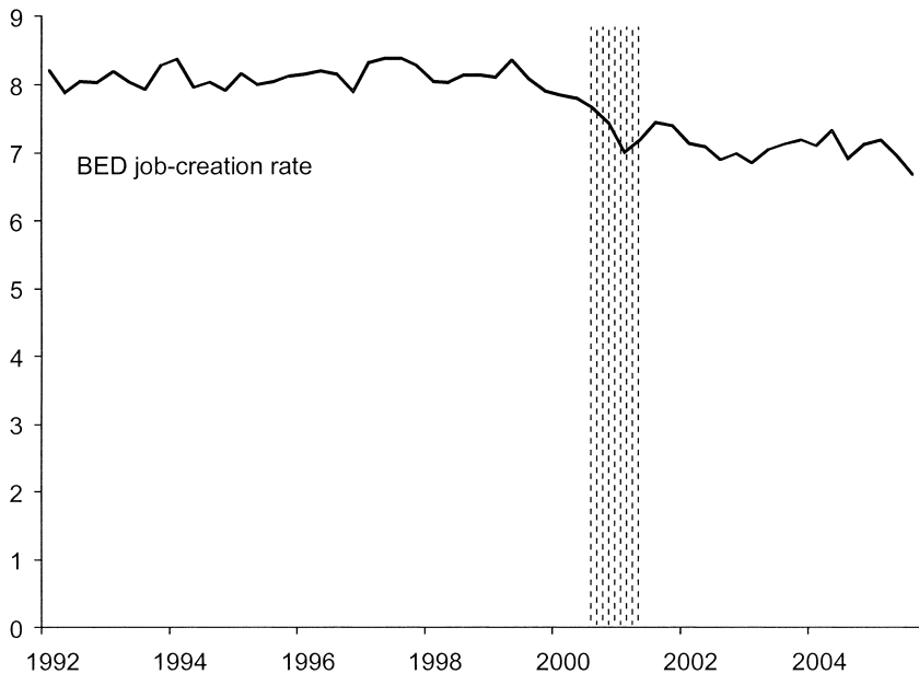
Fig. 5C.2 BED job-creation rate

creation a similar bump downward, but the view of general cyclical stability is confirmed.