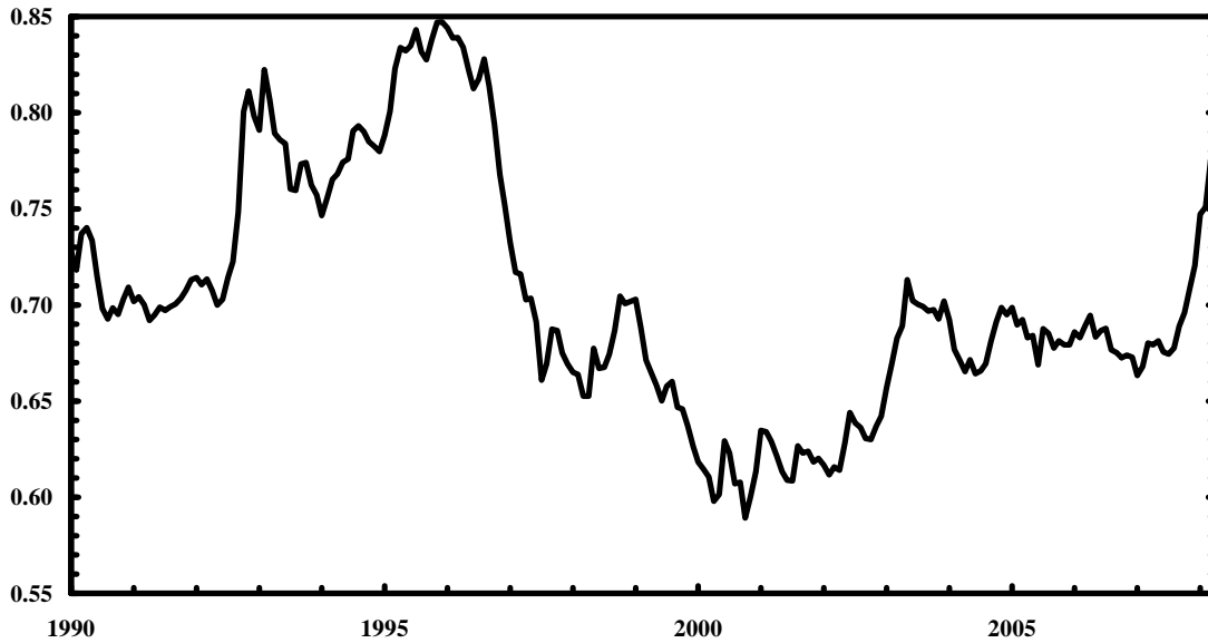
Figure 1. U.K./euro area exchange rate, 1990–2008 (pound sterling received per euro)