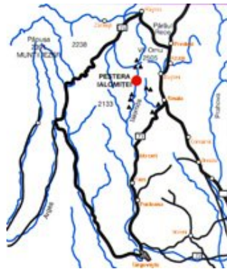
Figure 1. Bucegi Natural Park

From the internet all tourists could have some information regarding the most important touristic attraction as Bucegi Natural Park, Ialomicioara Monastery ,