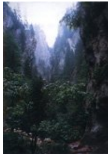
Figure 7. Orzei Gaps