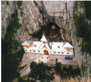
Figure 2. Ialomicioara Monastery and Ialomita Cave entrance