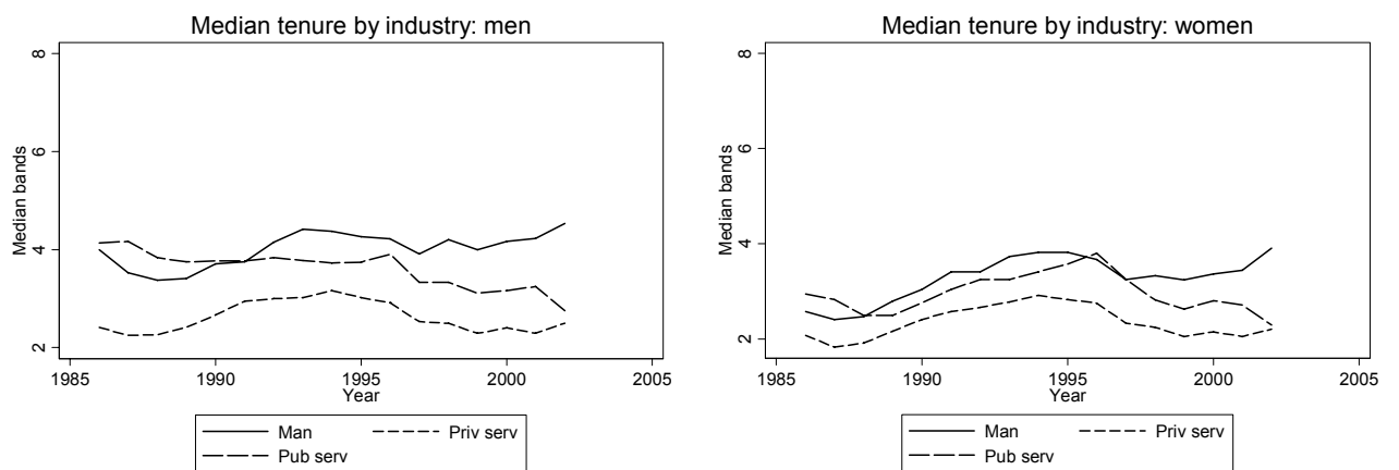
Figure 2. Median Tenure in Norway 1986–2002 by Gender and Industry.