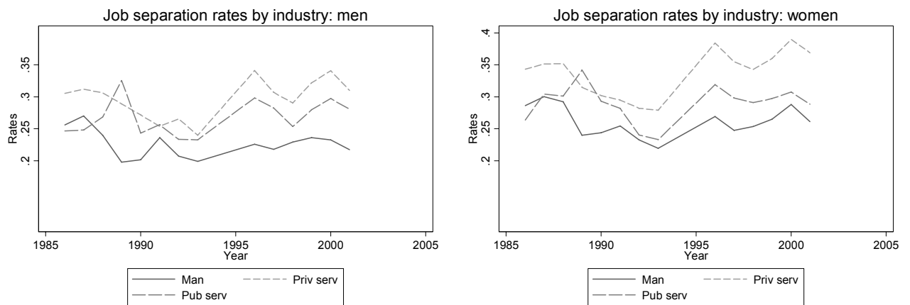
Figure 4. Separation Rates in Norway 1986–2001 by Gender and Industry.