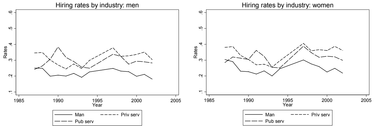
Figure 3. Hiring Rates in Norway 1987–2002 by Gender and Industry.