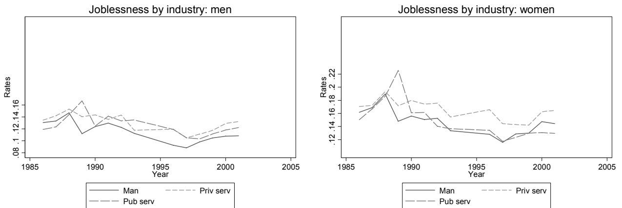
Figure 7. Joblessness in Norway 1986–2001 by Gender and Industry.