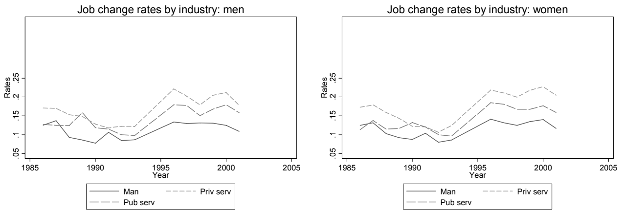
Figure 6. Job Change Rates in Norway 1986–2001 by Gender and Industry.