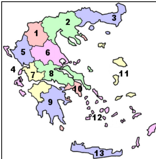
Figure 3: The 13 Regions of Greece