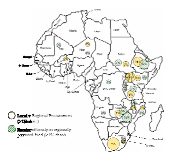
Figure 2. Location of Food Aid Procurement by WFP in Africa, Averages 2001-05

Analysis of the efficiency of WFP LRP activities in Africa relative to local market prices paints a generally favorable picture: the agency has consistently paid competitive prices in Zambia and has done so in Uganda since late 2004, while paying about a 10% premium in Kenya. In all countries, WFP has switched away from local procurement when local prices exceeded