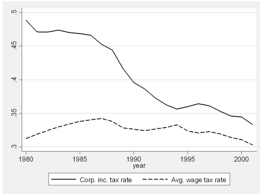
Figure 1: Average corporate income tax rate and wage tax rate over time

Note: The average was calculated on those 19 countries, for which uninterrupted data are available from 1980-2001.