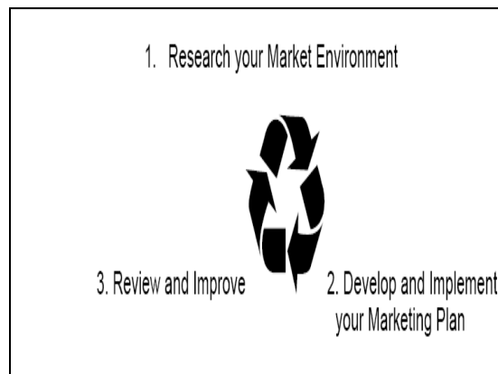
Figure 1: The marketing process overview