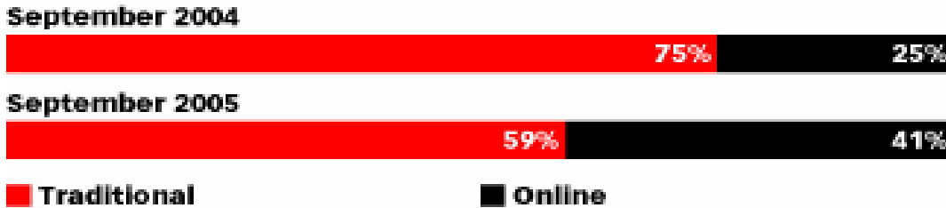
Figure 4: Traditional vs. Online marketing Budget Allocation of USA direct marketers 2004 & 2005 (as a % of total)