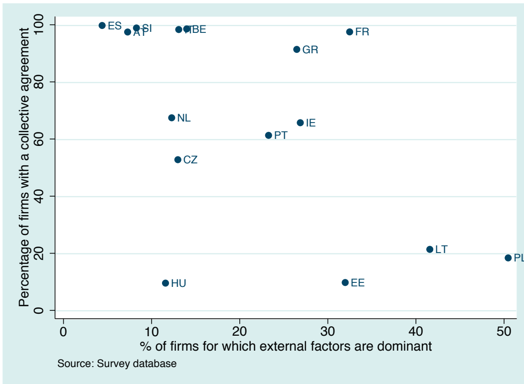
Figure 4.2: Collective Agreement Coverage and Support for External Factors