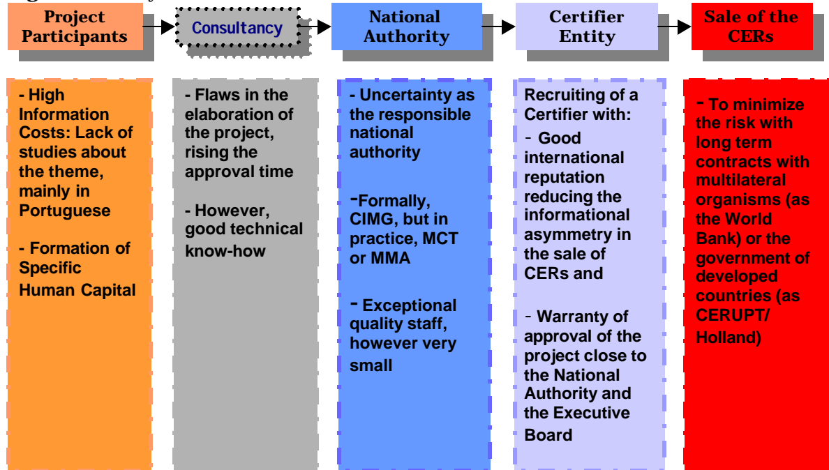
Figure 5. Survey Results