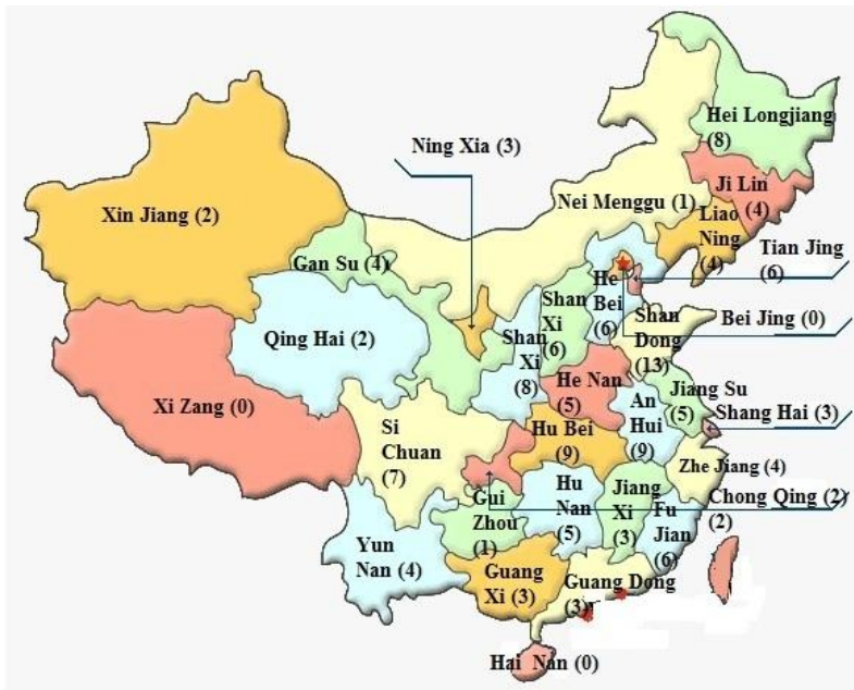
Figure 1. Geographic Distribution of Village Observations