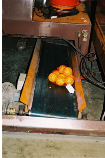
Figure 3: Visible dirt on the final sections of the repacking equipment used for the repacking of the experimental fruit

observations and microbiological sampling. The visual observations revealed that eight of the containers were relatively clean. However, two of the investigated containers were damaged, dirty, wet and rusty and one of the containers contained a definite foul chemical odour even though it looked clean. An example of these containers is shown in Figure 4.