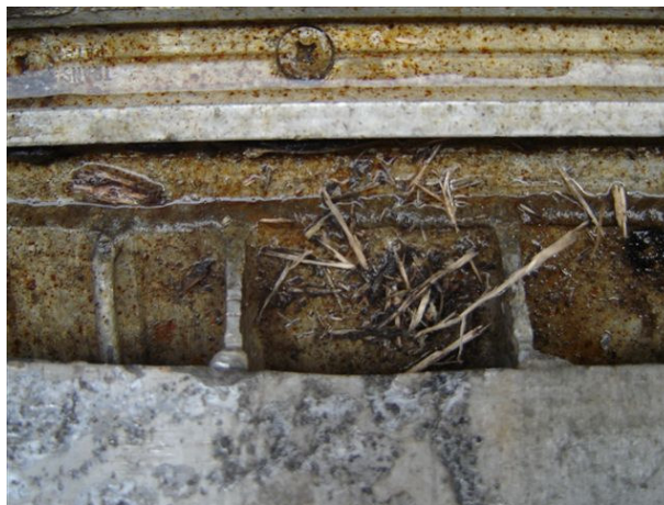
Figure 4: Moisture, rust and pallet splinters on a container floor