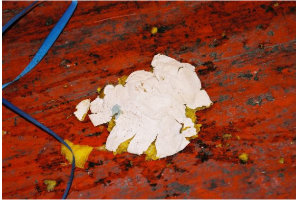
Figure 5: Inadequate waste container cleaning and disinfecting