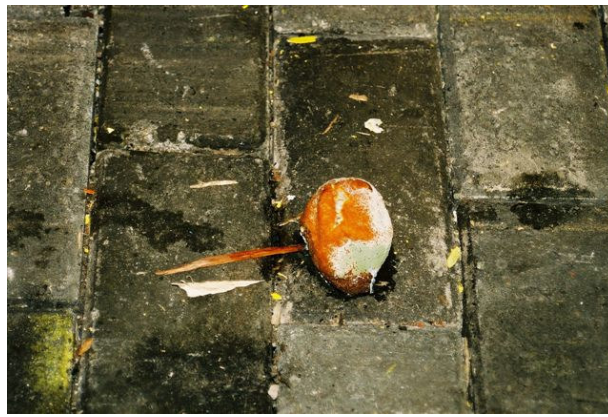
Figure 2: Physical contamination (pallet splinters) and an example of microbial contamination (rotten orange) on the floor of a distribution cold storage facility in Europe

In terms of hygiene aspects, a number of inadequacies were observed in the chain. Physical contamination and rotten fruit were observed in all the cold storage distribution facilities, as evident from the example in Figure 2 below. No evidence of chemical contaminants was observed. Some floor cleaning actions (sweeping and washing) were observed during the visits, but the cleaning actions generally only dealt with the passageways and did not involve cleaning between the shelves (where rotten fruit sometimes accumulated). These observations raised questions regarding the risk assessment basis of the hygiene programs in the various facilities.