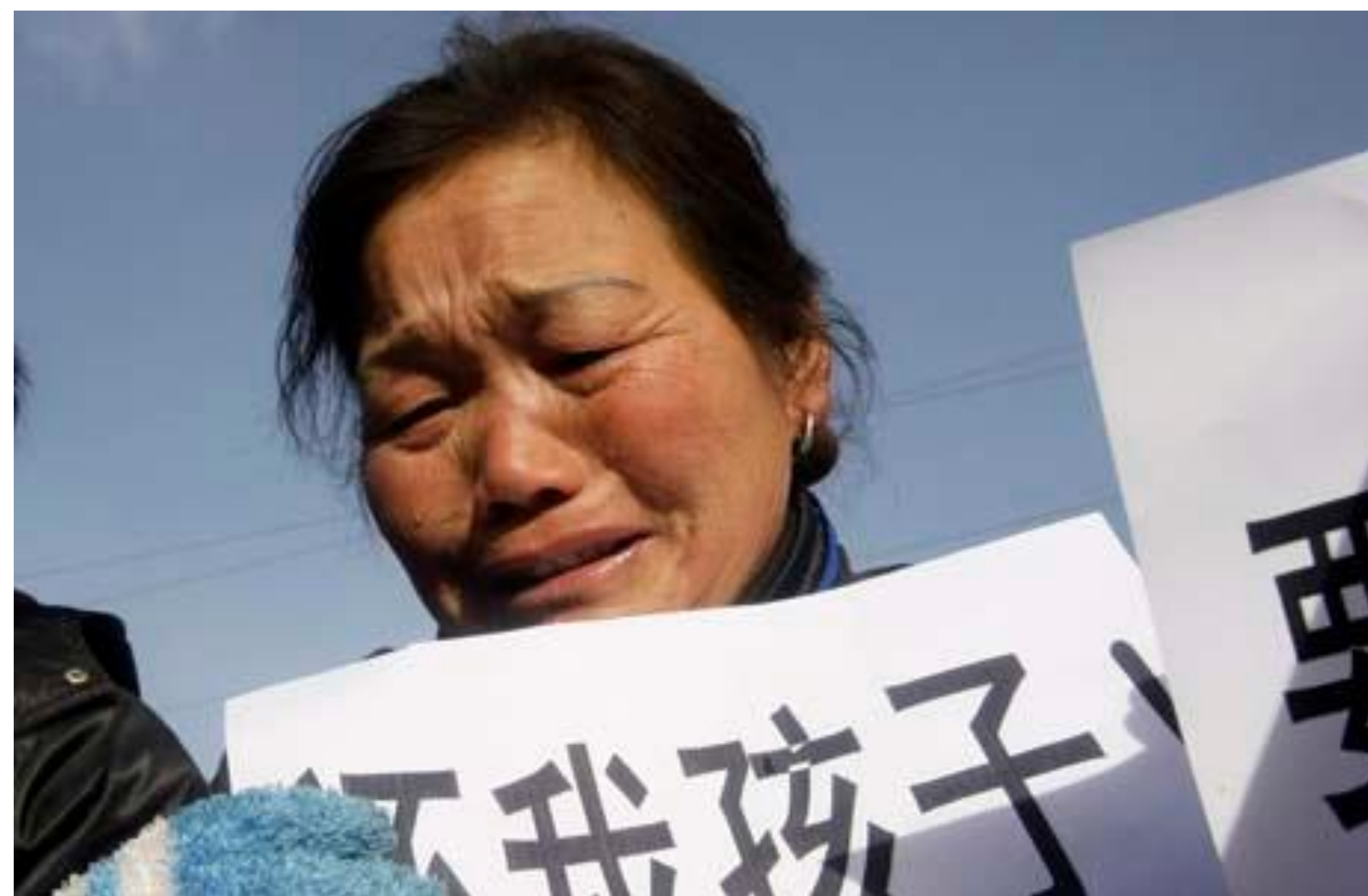
A woman, whose child died from drinking tainted milk, holds a sign reading 'Give me back my child' outside Shijiazhuang Intermediate People's Court