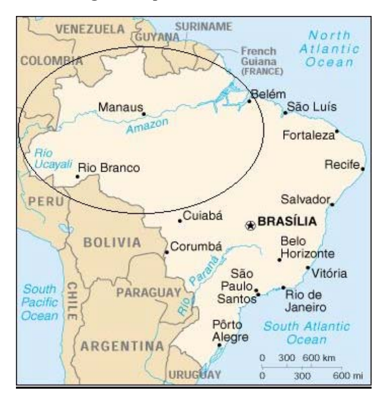
Fig. 1: Map of Brazil - Amazonia