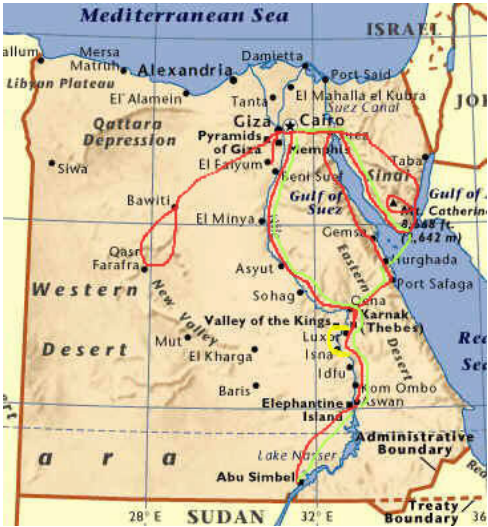
Figure 2.1 Egypt

Egypt is an independent republic with a democratic government. Within the Arab world, it is the most populous country and has second largest economy. It is neighboured by Sudan, Israel and Libya.