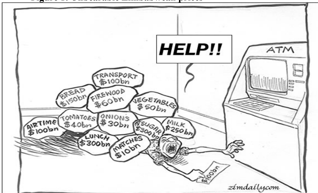
Figure 1: Unbearable Zimbabwean prices