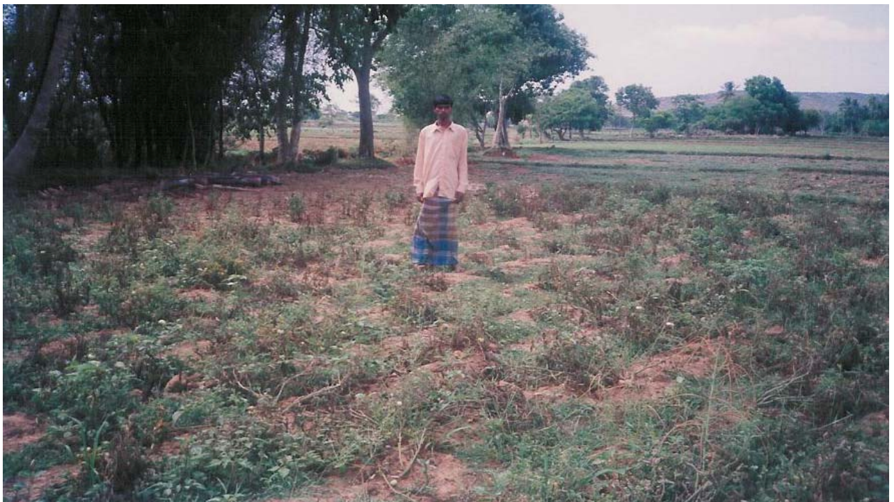
Fig 3: Wilted plants – crop damage due to use of distillery effluent groundwater for irrigation, Nanjangud, Mysore district, 2002-3