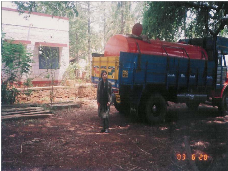
Fig 9: Spent wash being transported by distillery to free delivery to distant farms convincing the farmers that the spent wash is rich in nutrients in 2002-3