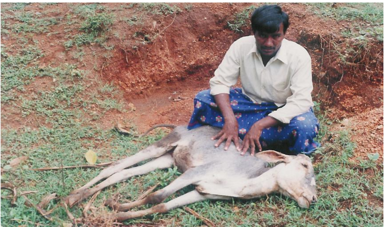
Fig 7: Farmer with his dead calf, due to frequent consumption of distillery effluent polluted water, Nanjangud, Mysore district, 2002-3