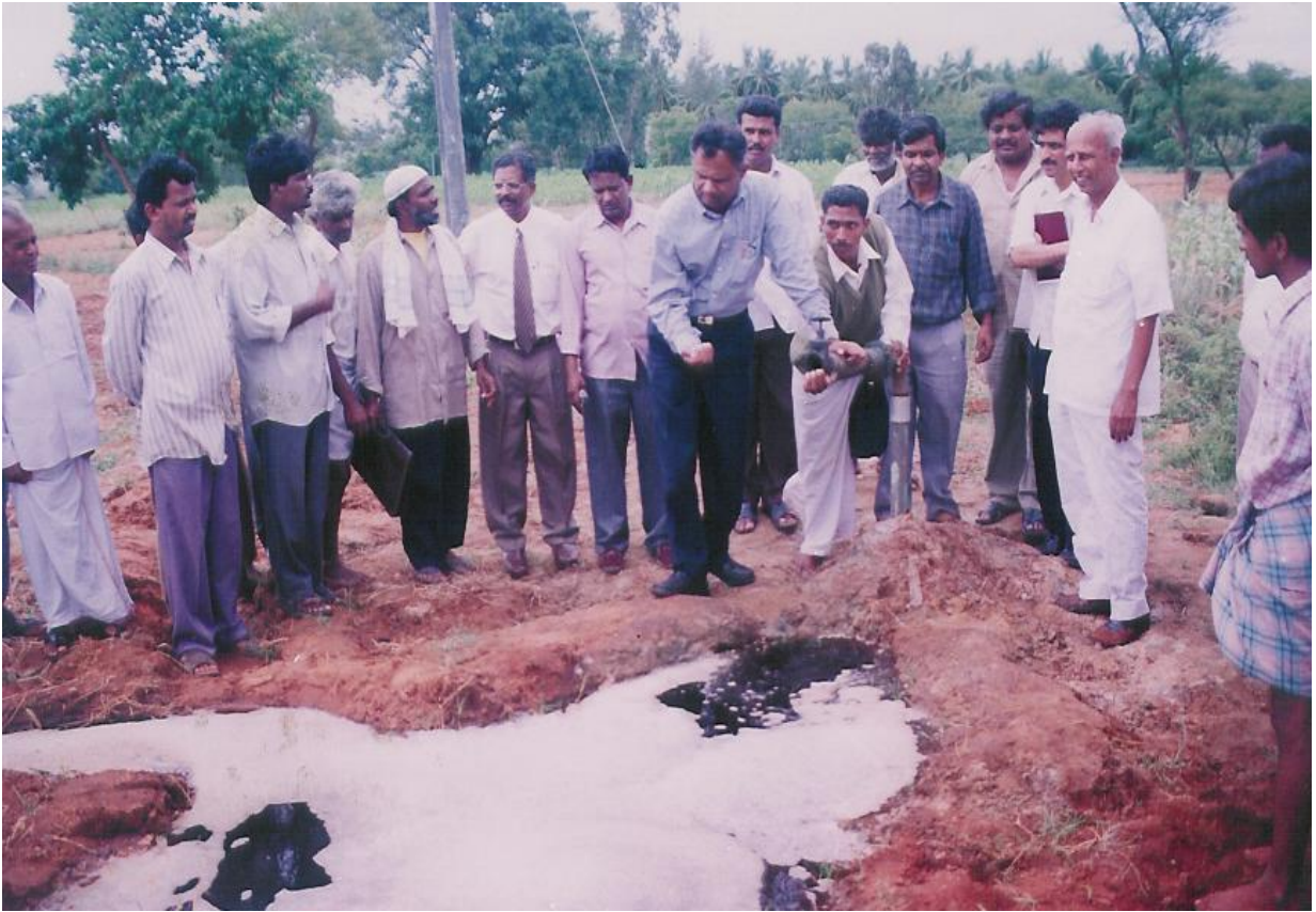
Fig 6: Lokayuktha officials watching the distillery effluent polluted water pumped out by a farmer, Nanjangud, Mysore district, 2002-3