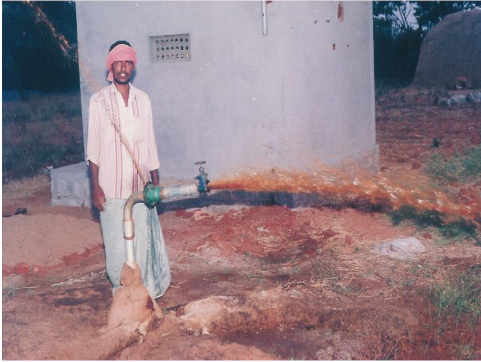
Fig 10: Distillery effluent polluted groundwater pumped out of the borewell in Nanjangud, Mysore district, 2002-3