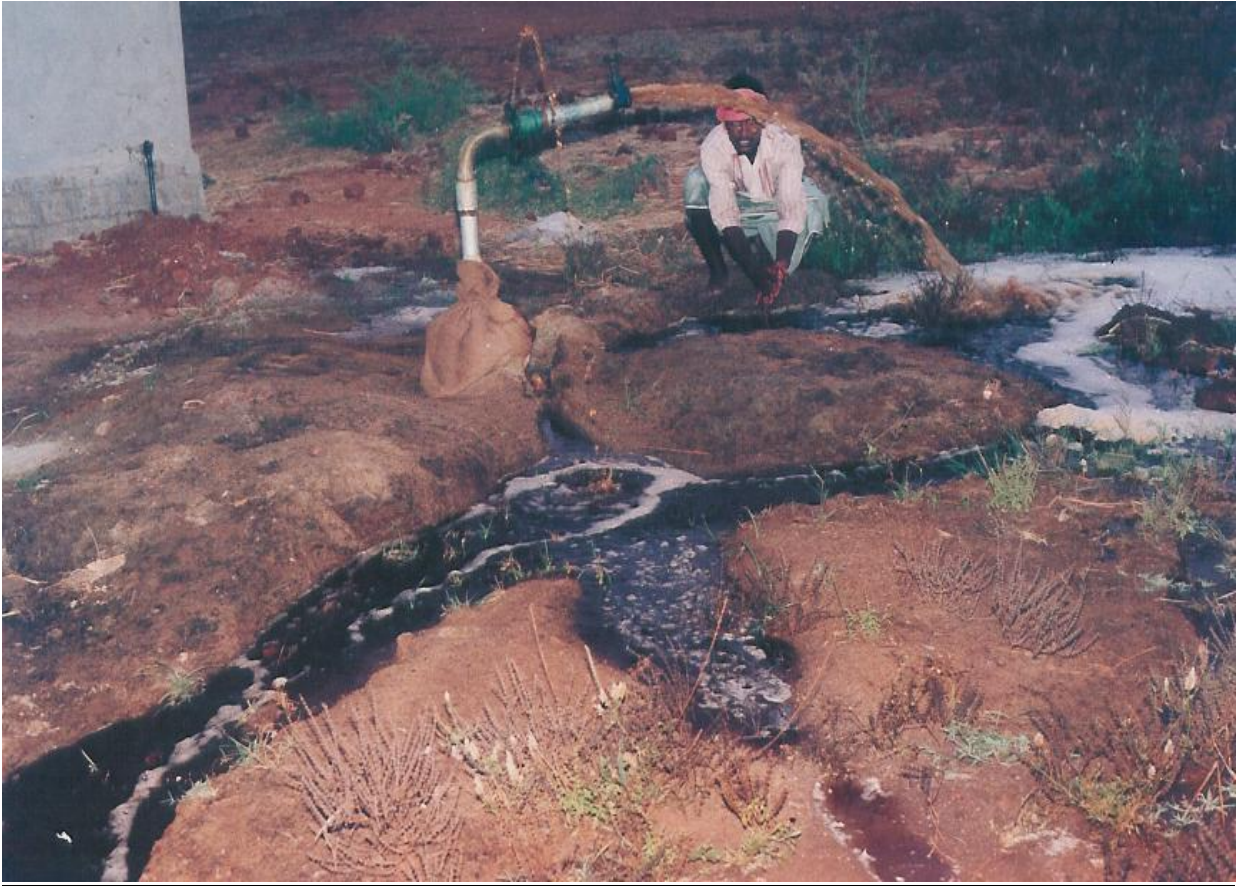
Fig 1: Distillery pollutant affected groundwater from borewell in Nanjangud, Mysore district, Karnataka, 2002-3