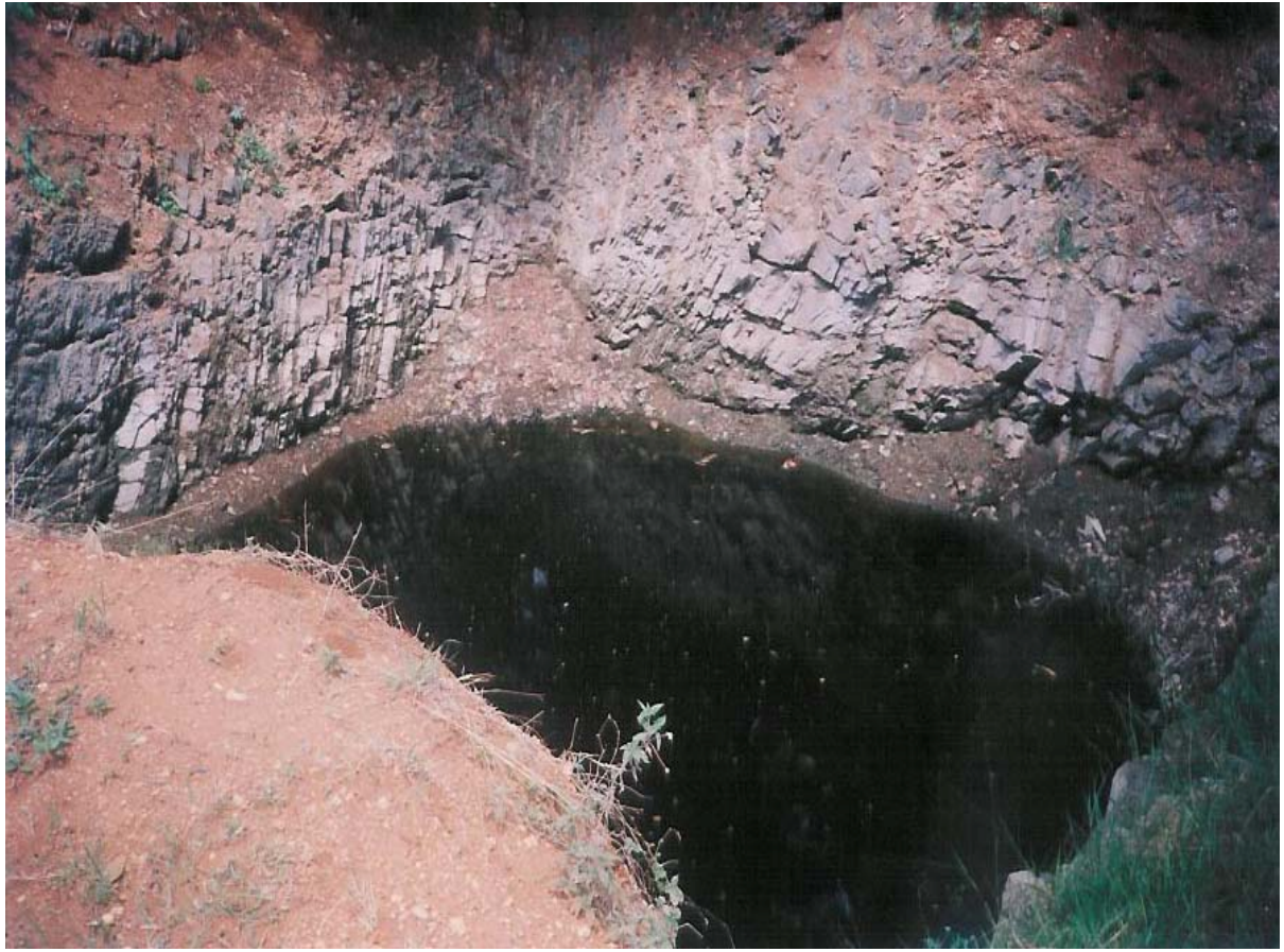
Fig 2: Dug well water polluted from distillery effluents, Nanjangud, Mysore district, 2002-3