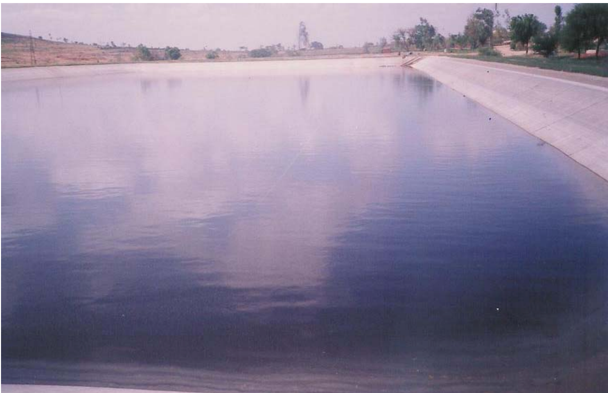
Fig 5: Spent wash from distillery effluents stored in lagoons, polluting groundwater extensively, Nanjangud, Mysore district, 2002-3