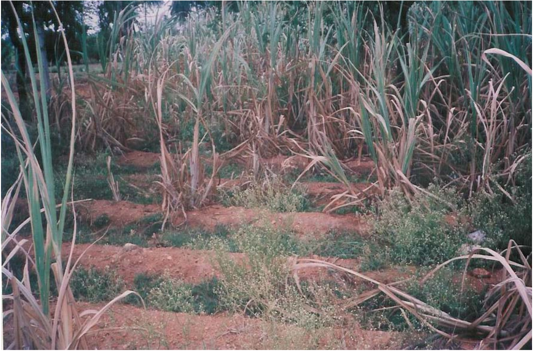
Fig 8: Sugarcane crop stand affected by distillery pollution affected water, Nanjangud, Mysore district, 2002-3.