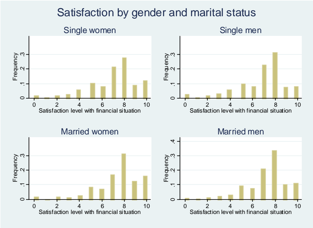
Figure 1: Frequencies of reported levels of satisfaction with financial situation