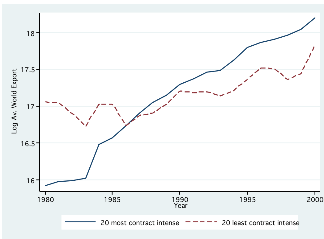
Figure 1: World Exports of the 20 highest and 20 lowest contract-intense industries