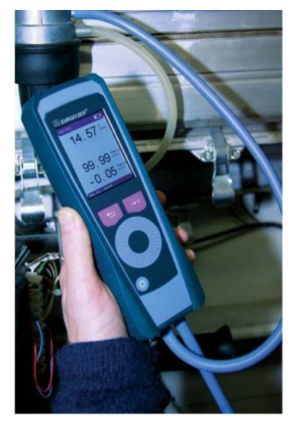
Figure 3: The gas analyser Eurolyzer ST

The innovation used in the experiment is a new high-tech gas analysis device (figure 3). These gas analysis computers are a highly effective, real-world entry-level solution for measurements at oil and gas-fuelled systems.